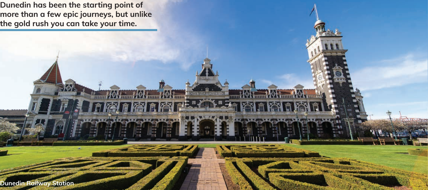
Dunedin Railway Station

Dunedin has been the starting point of more than a few epic journeys, but unlike the gold rush you can take your time.