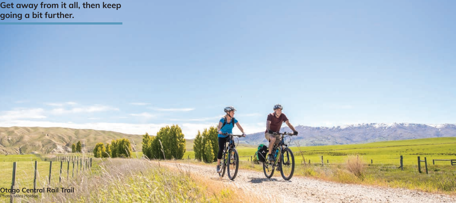
Otago Central Rail Trail

Get away from it all, then keep going a bit further.