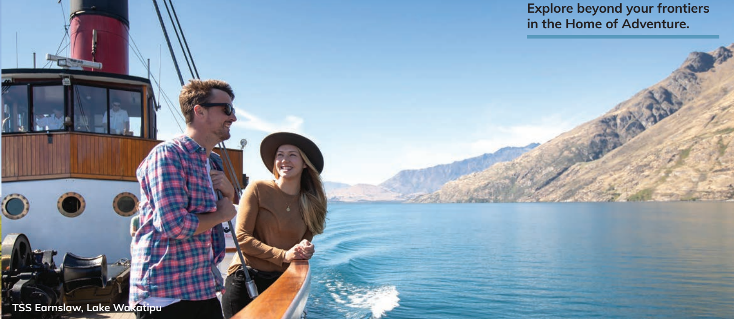
TSS Earnslaw, Lake Wakatipu